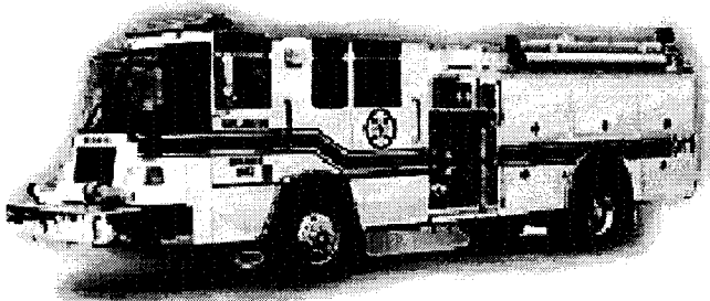
Pierce's New Quantum Fire truck